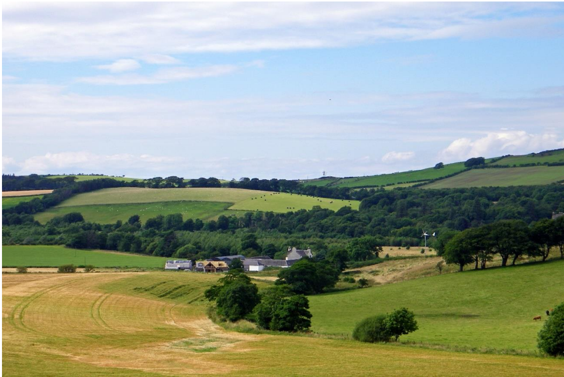
Hawkhill and beyond