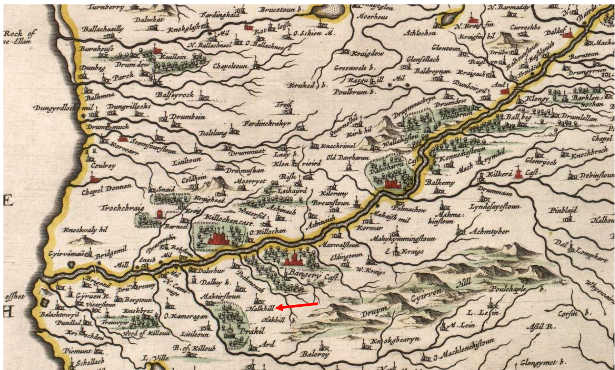
This 1654 map shows the location of the earlier Hawkhill (Halkhill).