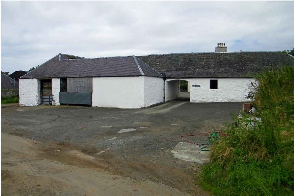
Hawkhill's main entrance along the road