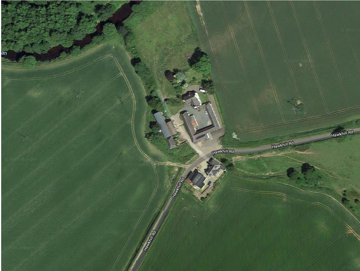
This Google Satellite image of Hawkhill includes some newly built houses that replaced the outbuildings that used to be on the south side of the road.